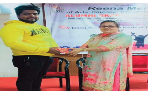
Digital Marketing Seminar by Jr.College