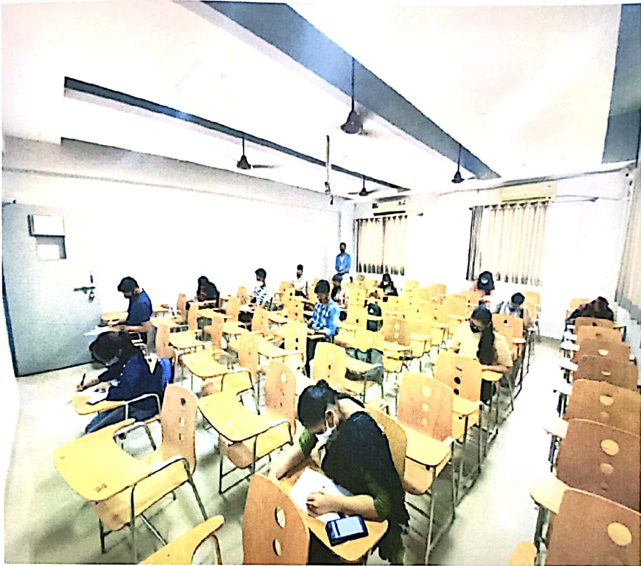
Photo of Essay Competition on “Youth Innovation for Human and Planetary Health”