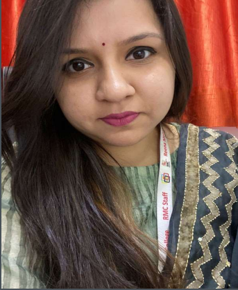
Professor HOD BMS