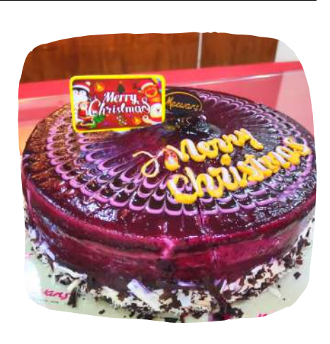
Here's how we celebrated Christmas this year at RMC (2022) !!!

A couple of days before Christmas, our minds were filled with a lot of excitement about the celebrations. First off, we decided on a place to keep the Christmas tree ie. inside the auditorium. The entire staff of RMC junior college participated to decorate the traditional Christmas Tree. The attractive stars, beautiful balls, colorful balloons, and ribbons gave an amazing festive look to the tree. The Secret Santa college edition was a fun and exciting way to bring all the faculties, teaching and non- teaching staff, of the junior as well as the senior together during the holiday season. It was a great opportunity to exchange gifts, have some laughs, and get to know each other better. Names were drawn earlier and each faculty got gifts for the respective name and were placed under the Christmas Tree.