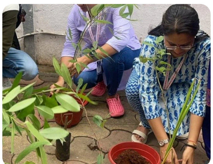
Mira Bhayandar, Maharashtra, India