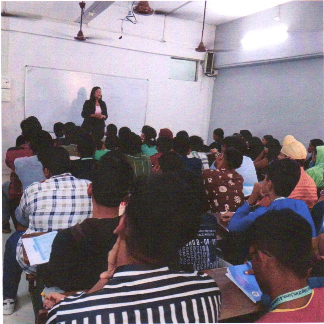
Students Grievance Redressal Cell Activity

[Signature] I/C Principal Reena Mehta College of Arts, Science Commerce & Mgt. Studies Bhayandar (West), Dist. Thane 401 101